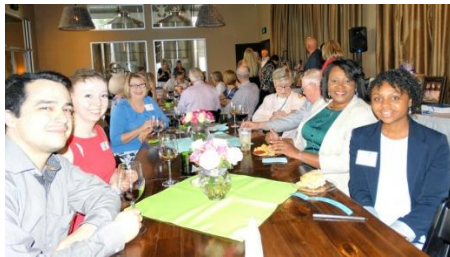
Fun at the Auction