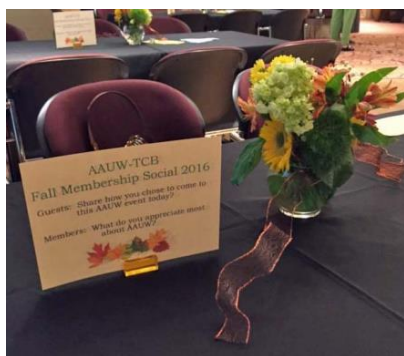
Table Decorations and Topics