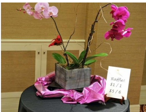
Orchids for Centerpiece and Raffle