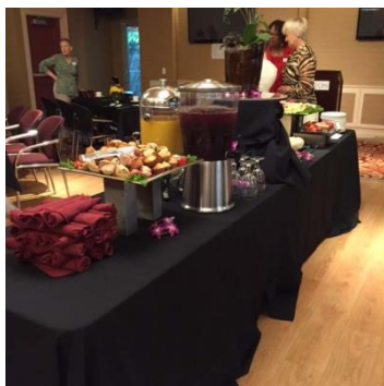
The Stayton: Social Buffet